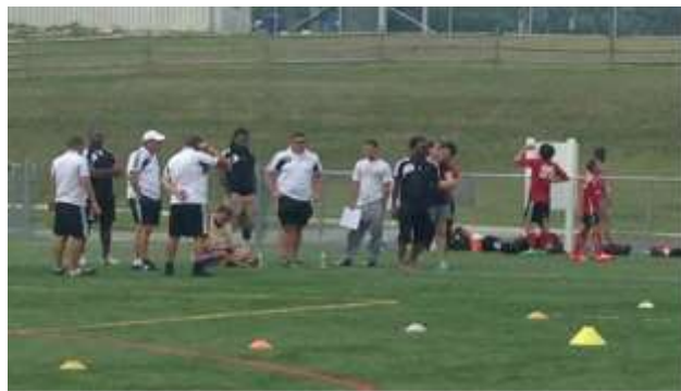
Annual Coaches Games